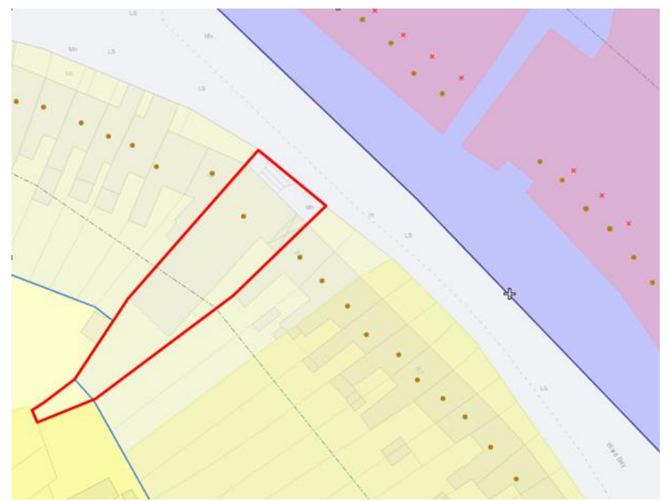
Zone Z1: To protect, provide and improve residential amenities