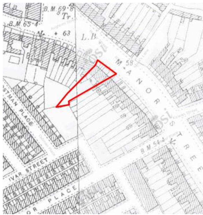
1913 OSi map showing the approximate location of the cinema site. Note the wedge shaped site is more apparent (<a href="http://map.geohive.ie/mapviewer.html">http://map.geohive.ie/mapviewer.html</a>, accessed 19/09/18)

Earlier cinemas were housed within existing buildings, however Manor Street Picture House was a purpose built cinema, opened in 1914. The site was previously occupied by terraced houses which were cleared possibly due to dereliction allowing the scope for this cinema to be constructed on this wedge shaped site. Originally the cinema had a balcony and a large seating capacity of 630 seats. The main entrance was originally covered with a glass and iron canopy, making the building stand out from